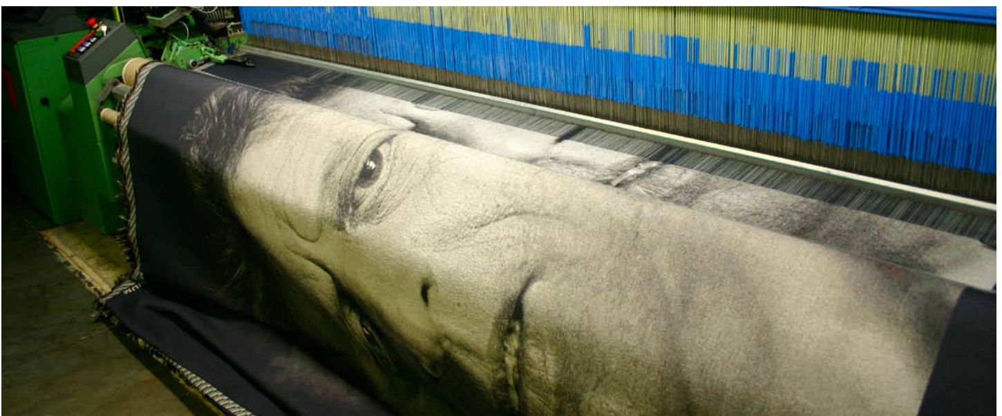
Philip Glass Tapestry on the loom.