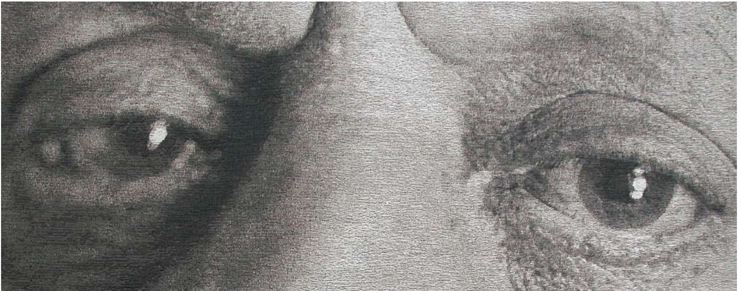
Detail - Chuck Close, Philip Glass Tapestry .

rock and roll into classical forms. As Glass says, “With this kind of direction, you don’t really run out of things to do. That would be like saying the world runs out of ways of being interesting. The material world is always interesting.”