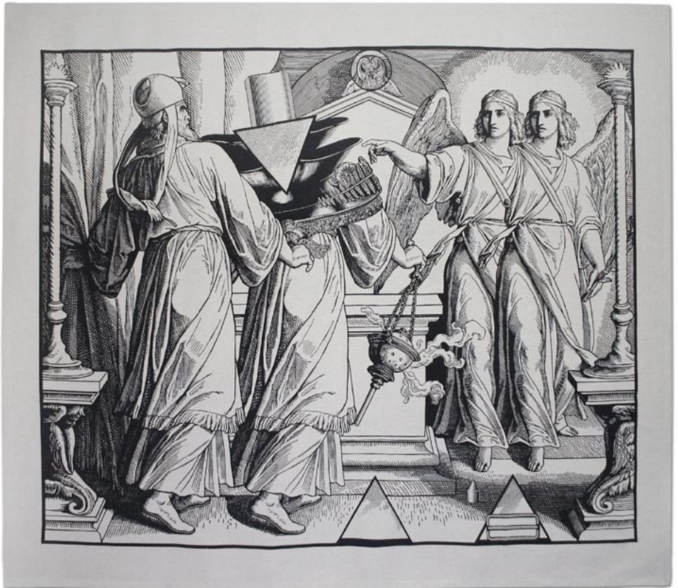
Bruce Conner - DOUBLE ANGEL , 2004 - Tapestry, 105 x 115 in.

Reclining Youth , 1959/2003 will subsequently be on view at a show of primarily paintings and drawings at the Seraphin Gallery in Philadelphia. There will be a concurrent show in Philadelphia at the Lawrence Gallery of the Rosemount College.