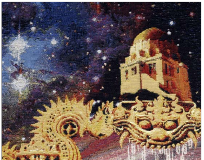
Detail from Allegory of the Infinite Mortal