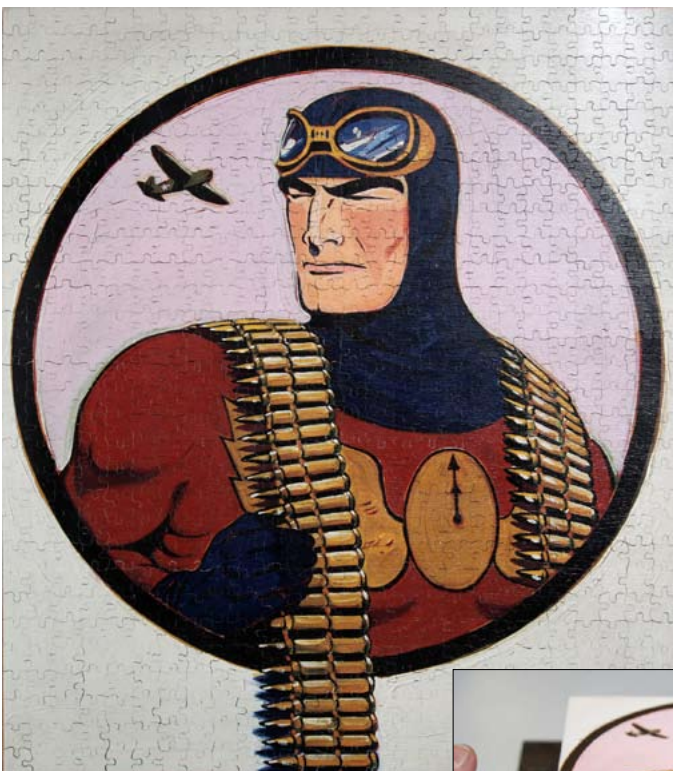
Mel Ramos - Captain Midnight Puzzle , 2011 Acrylic on laser cut gessoed panel with custom box Puzzle: 22 x 19 x 0.25 in. Box: 8.5 x 8.5 x 3.5 in. Edition of 30

Mel Ramos's latest edition puts a classic painting by the Pop art legend at your fingertips: Captain Midnight Puzzle is an