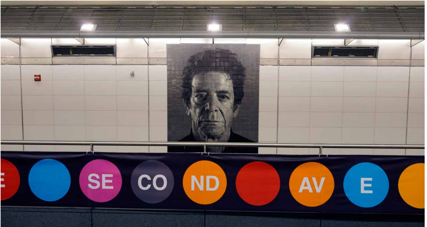
Chuck Close - Subway Figures , 2017 (installation view of Lou Reed portrait). Ceramic tile with hand-painted glaze; 9 x 7 ft; photo by Donald Farnsworth.

Magnolia Editions is pleased to announce the studio's involvement in what has been billed as the "largest public art installation in New York history," when Subway Figures (2017) by Chuck Close and works by three other artists were permanently installed in New York City's Second Avenue subway expansion, opening January 1st, 2017. Magnolia Editions fabricated ceramic tile portraits of Lou Reed and Philip Glass from Close's Subway Figures ; over the past eight years, the studio also developed the technique used to fabricate these two portraits.