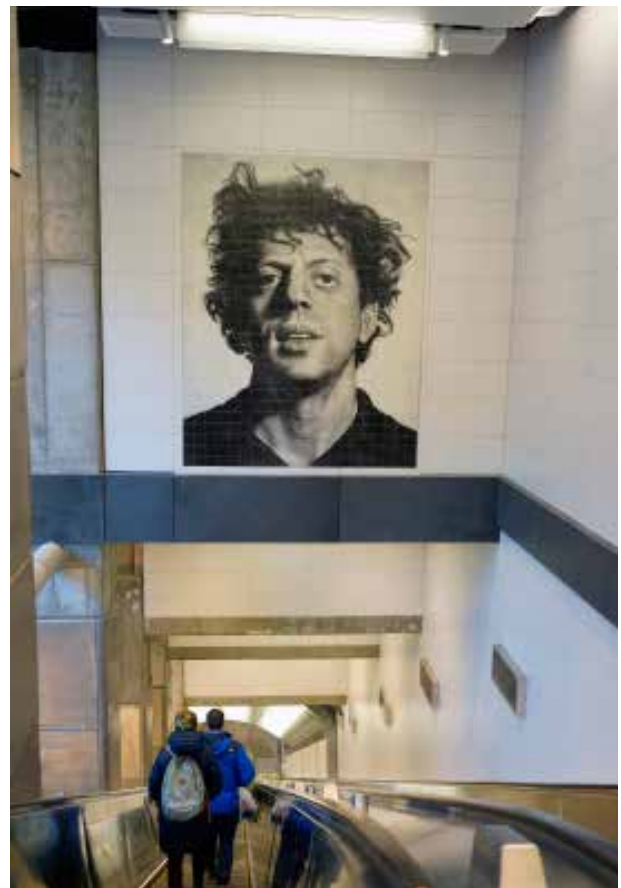
Subway Figures, 2017 (installation view of Philip Glass portrait). Ceramic tile with hand-painted glaze; 9 x 7 ft