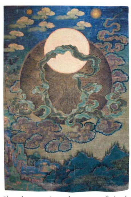
Dharmakaya, 2005, Jacquard tapestry, 120 x 80 in, ed: 3