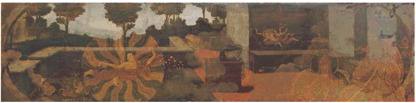
Untitled work in progress.

Just as Tamarind and Gemini put the commercial lithographic technology of the 19th century into the hands of fine artists in the fifties and sixties, the Magnolia Tapestry Project is putting the electronic Jacquard loom to work in unexpected ways for today's artists. The Project includes tapestries representative of several generations and numerous art movements: the abstract wizardry of Ed Moses; the formally rigorous portraits of Chuck Close; the monumental, Expressionistic figures of Leon Golub; the hyper-realism of Alan Magee and Guy Diehl; the playful poetics of Squeak Carnwath; the post-Surrealist visions of Bruce Conner, and the Abstract Expressionist topographies of George Miyasaki are all re-envisioned in striking new editions. The Project has also produced tapestries by Hung Liu, Mel Ramos, Rupert Garcia, Lewis deSoto, Lia Cooke, Diane Andrews Hall, Gus Heinze, Robert Kushner, John Nava, Nancy Spero, Katherine Westerhout and others.