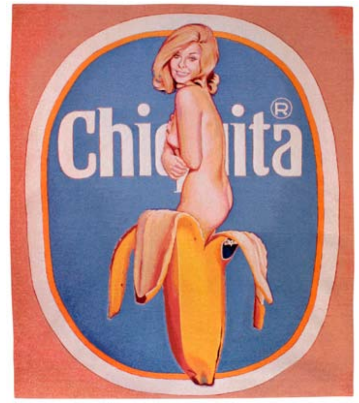
Chiquita , 2004 Jacquard tapestry, 82 x 71 in., edition of 24

and advertising models -- emerged as his leitmotif. As fine art multiples created using industrial technology, Ramos's tapestries are appropriately in step with the spirit of 60s Pop. The editions he has created with the Magnolia Tapestry Project revisit some of Ramos's personal favorites from a career that, having spanned nearly fifty years, shows no sign of slowing down.