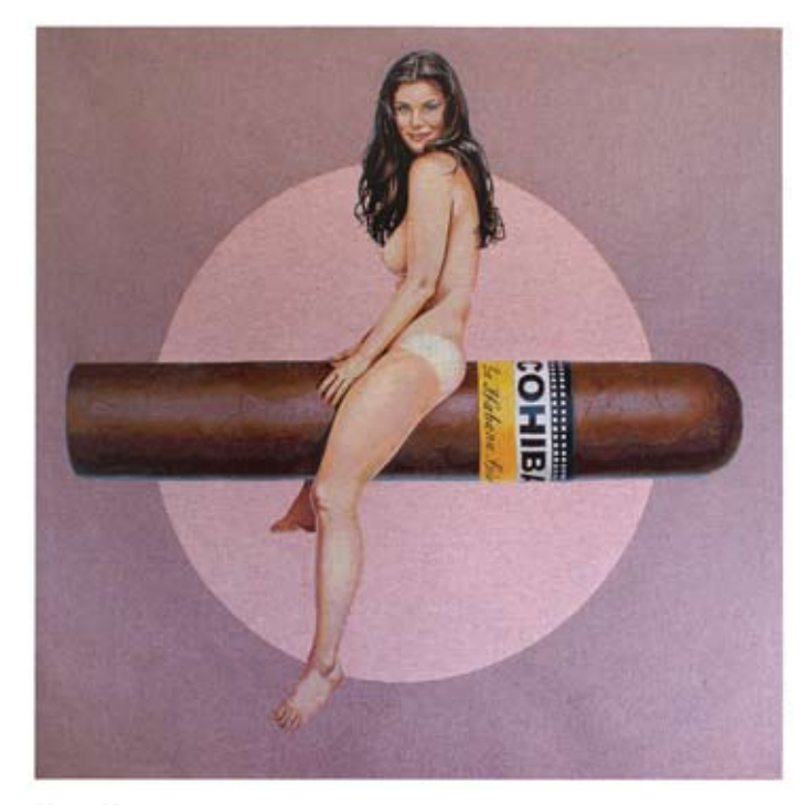
Hav-a-Havana , 2005 Jacquard tapestry, 69 x 69 in., edition of 24