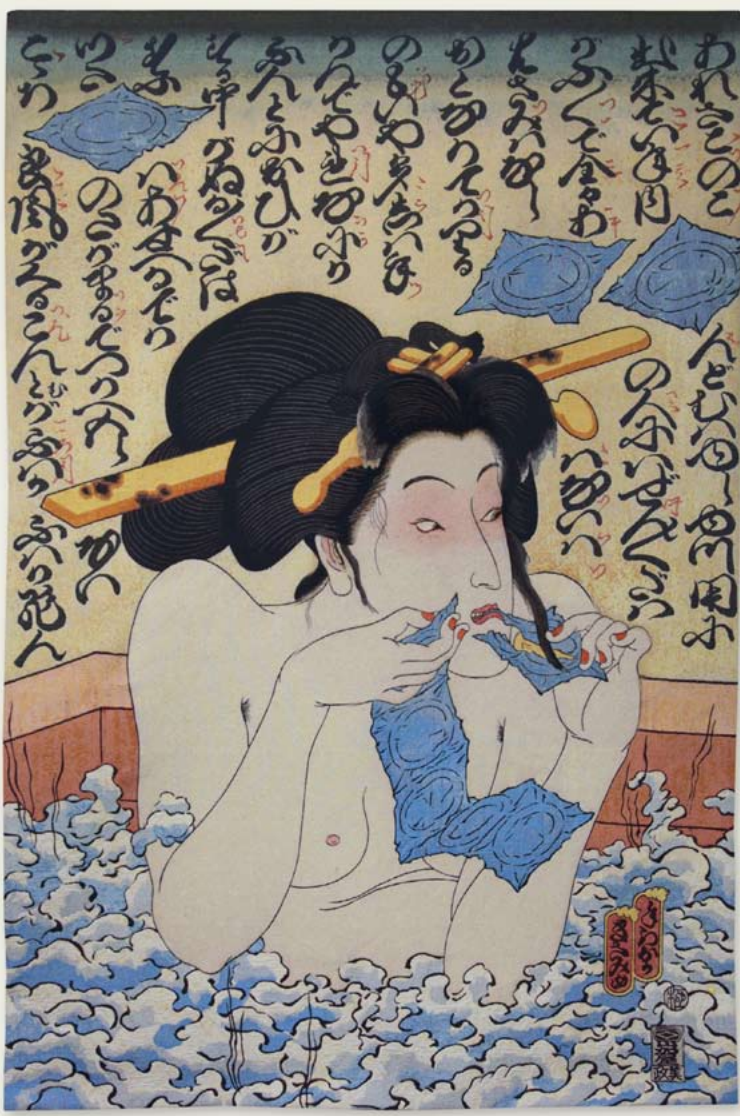
Masami Teraoka - AIDS Series: Geisha in Ofuro , 2010 Jacquard tapestry with hand applied acrylic; approx. 115 x 76 in. Color Trial Proof