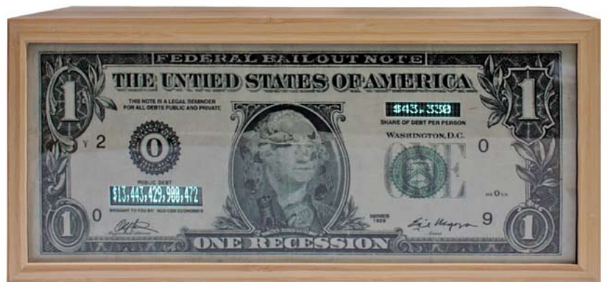
Enrique Chagoya - One Recession Watchdog (Instant Update) , 2011 Mixed media with embedded electronics and wooden case 8.5 x 18.25 x 4.5 in. Edition of 8

Enrique Chagoya’s latest edition from Magnolia is a kinetic, sculptural take on his 2009 One Recession print edition. Housed in a custom wooden casing, Chagoya’s One Recession Watchdog (Instant Update) takes its imagery from the humorously altered dollar bill of One Recession and adds a dose of reality to the fun: an internal mechanism, connected via wireless internet, displays the current national debt and the amount owed per U.S. citizen on two constantly updated LED displays.