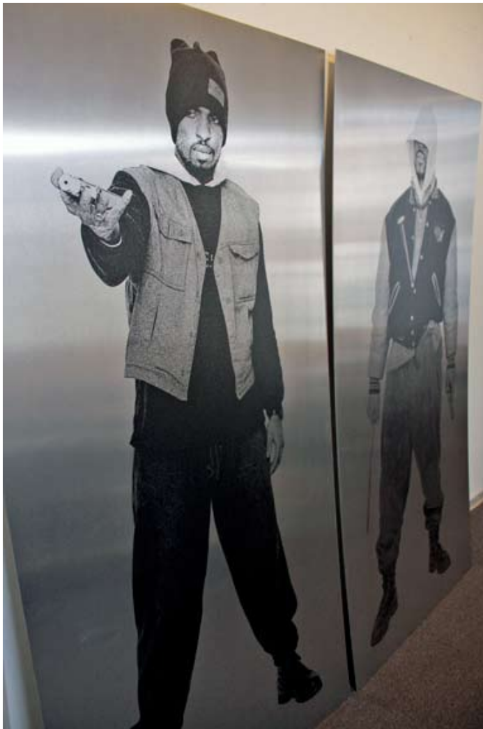
Prints on aluminum from the I Wanna Kill Sam series by Faisal Abdu'Allah.

to the plate and changing its orientation to portrait. Between Accident and System combines a palette of bright greens and muted pastels with the wide range of plate tones and textures that make a Miyasaki print instantly recognizable. Each print in the suite of fourteen has its own unique mood – it is worth stopping by the studio to experience all of them. ■