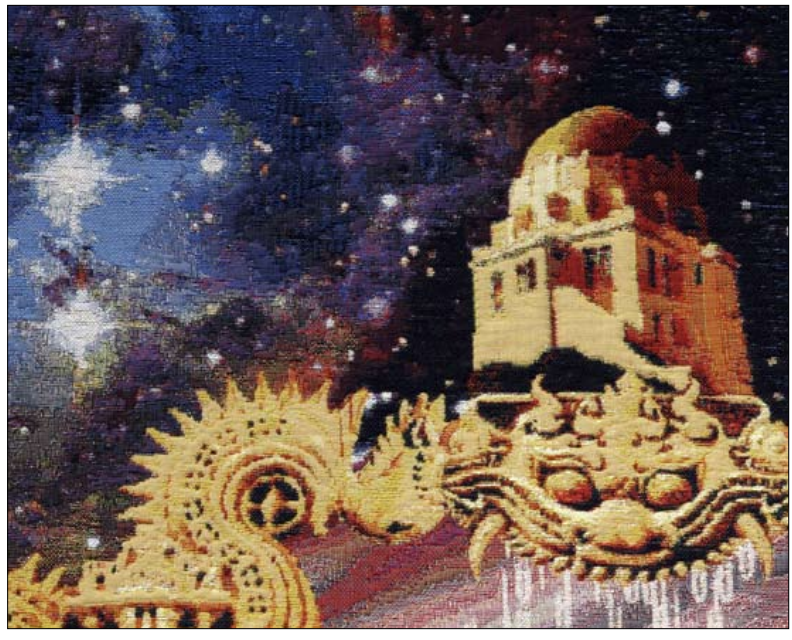
Detail from Allegory of the Infinite Mortal