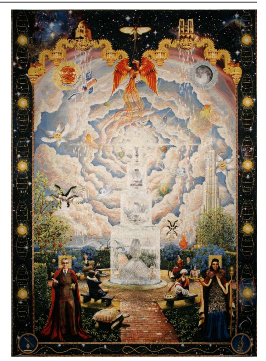
Andy Diaz-Hope & Laurel Roth - Allegory of the Infinite Mortal, 2011; Jacquard tapestry; 76 \times 108 in. Edition of 8

Tues - Sun: 9:30 am - 5:15 pm; Fri: 9:30 am - 8:45 pm; closed Mondays 50 Hagiwara Tea Garden Drive in Golden Gate Park