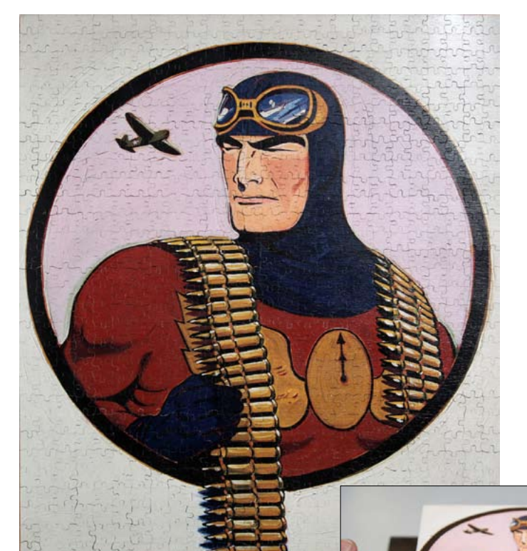
Mel Ramos - Captain Midnight Puzzle, 2011 Acrylic on laser cut gessoed panel with custom box

Mel Ramos's latest edition puts a classic painting by the Pop art legend at your fingertips: Captain Midnight Puzzle is an