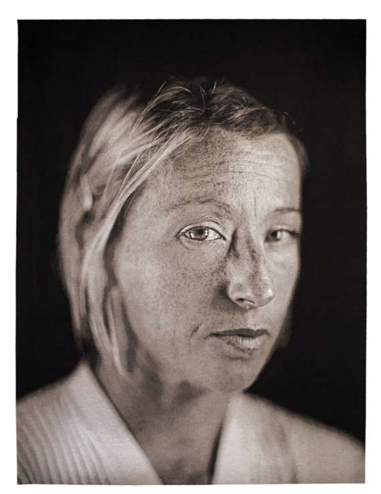
Cindy, 2006 - Jacquard Tapestry, 103 x 79 in. Edition of 6

Close selects images for the tapestries from a series of daguerreotype portraits created in collaboration with Jerry Spagnoli within the last decade. The gilded, silver-coated daguerreotype plates are scanned at high resolution by Adamson Editions in Washington, D.C.; the scans are