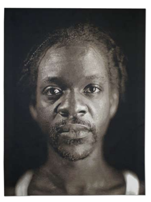
Lyle, 2006 - Jacquard Tapestry, 103 x 79 in. Edition of 6