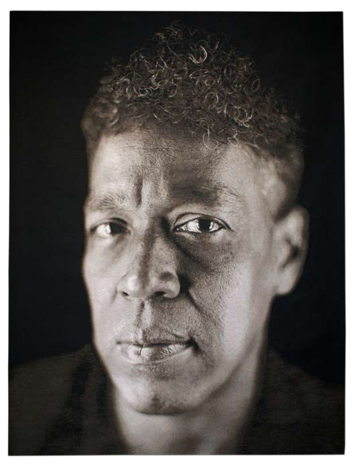
Andres, 2006 - Jacquard Tapestry, 103 x 79 in. Edition of 6

then translated by Magnolia Editions co-director Donald Farnsworth into digital "weave files." These files are woven in Belgium with a seven-foot wide, double-head electronic Jacquard on a customized Dornier loom, utilizing 17,800 warp threads of repeating groups of 8 colors. The weft threads are comprised of 10 repeating colors, chosen by Farnsworth specifically for Close daguerreotypes, woven at 75 "shots" per centimeter, for a total of 190 weft threads per inch. Close's tapestries incorporate a fusion of methods separated by over two hundred years: on one hand, the lyricism and nearly infinite detail of a 19th-century photographic technique; on the other, the Magnolia Tapestry Project's innovative, digitally-driven approach to weaving, a result of experiments conducted only within the last decade.