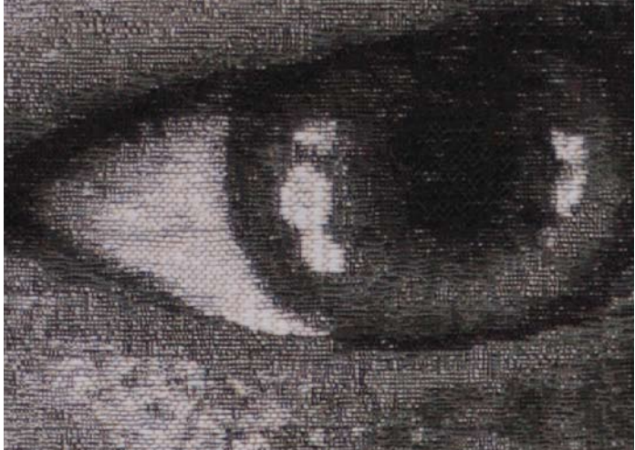
Detail from Brad, showing the thousands of individual weave structures which make up the image.