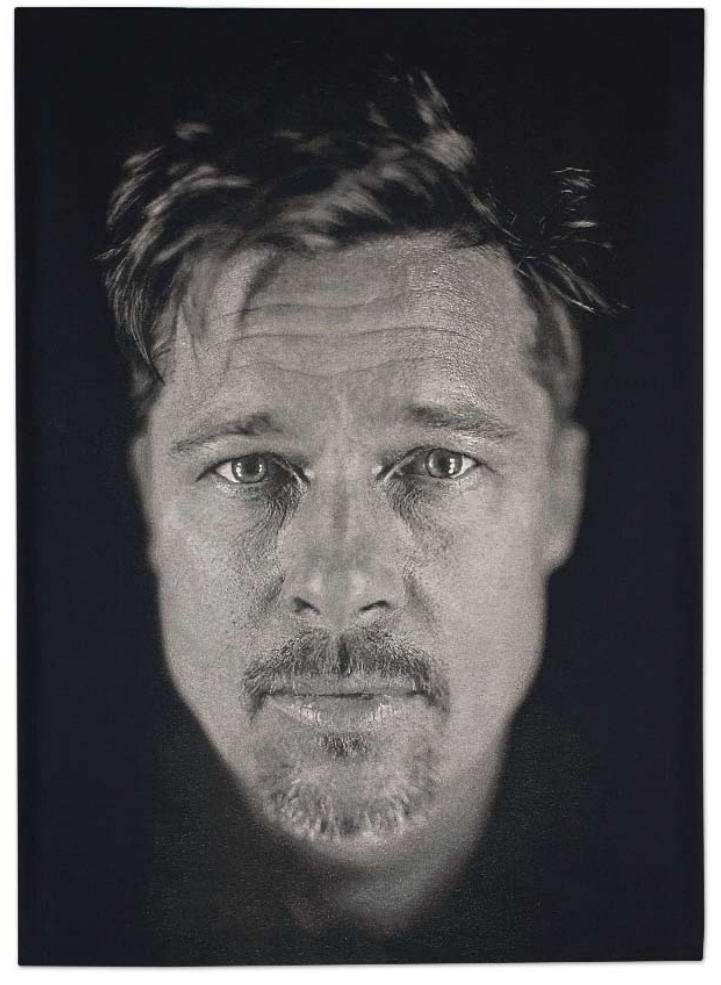
Brad, 2009 - Jacquard tapestry, 104 x 78 in. Edition of 10

To create his woven editions, Close works with Magnolia Editions' Donald Farnsworth to develop a digital instruction set, called a weave file, translating the daguerreotype image into data which can be read by an electronic Jacquard loom in Belgium. This customized Dornier loom uses 17,800 Italian dyed cotton warp threads woven at 75 shots per cm, generating colors via different combinations of eight warp thread colors and the ten weft thread colors selected by Farnsworth. A color palette must be developed for each tapestry edition containing all of the necessary values. A weave file is then constructed based on this palette. "There is more raw data in one weave file," explains Farnsworth, "than if you combined the text of all of Shakespeare's plays."