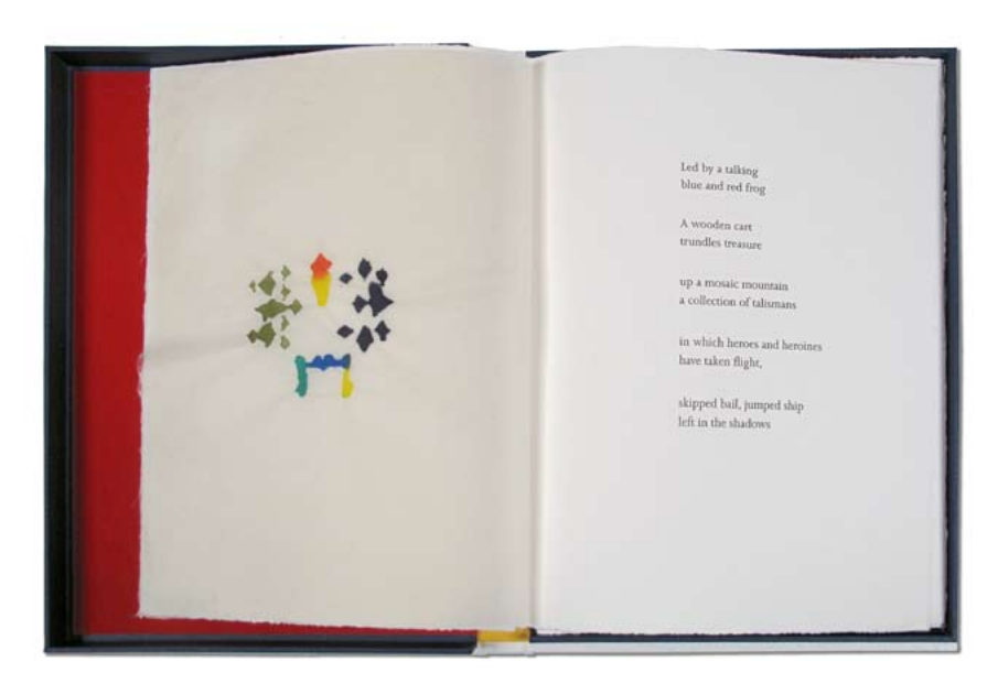
A Child's Vi[r]gil, 2010 - Artist's book with portfolio 12 \times 16.25 \times 2.3 in. (open: 12 \times 25.25 \times 2.3 in) Edition of 24