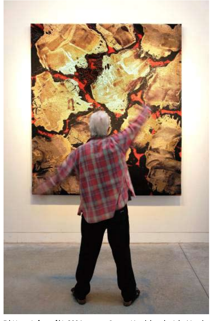
Ed Moses in front of his 2006 tapestry, Bronze Man.

To create the "Magma" series of paintings from which his first series of tapestries were translated, Moses worked outdoors on a driveway, laying wet canvas panels on wheeled wooden "skateboards." Over multiple work sessions, Moses moved from panel to panel applying acrylic and metallic paints with mops, squeegees, squirt bottles and other unusual means. Previously, Moses has sanded down the surfaces of his paintings, coated them with translucent resin, infused them with glitter and stained them with asphaltum. His use of the tapestry medium represents a means to further transform the texture of painted surfaces, to push the work beyond narrative or figuration toward an inchoate and immediate sensory experience.