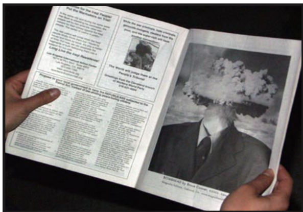
The People Judge George W. Bush is a publication by the International Action Center. www.iacenter.org

During the Republican Convention in August, Bruce Conner's BOMBHEAD appeared in a publication which circulated through the streets of Manhattan. The People Judge George W. Bush was put together by the International Action Center, an organization initiated in 1992 by former US Attorney General Ramsey Clark and anti-war activists protesting the Gulf War. The newsprint journal was a program for the IAC's War Crimes Tribunal that doubled as a Field Guide to the Republican National Convention Week of Resistance. Magnolia Editions and Bruce Conner jointly purchased the full-page ad, not anticipating sales from upcoming activist art collectors, but to experiment with audience and context. In the publication BOMBHEAD becomes another view of American foreign policy, an artist's critique alongside the activists' and intellectuals'. BOMBHEAD is the only artwork featured in the journal. ■