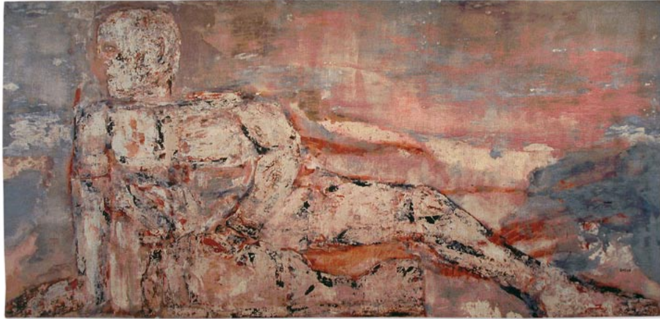
Reclining Youth , 1959/3003, Tapestry, 82 x 169 in.