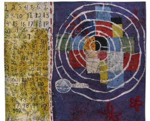
Lucky Star , Squeak Carnwath, 2004, tapestry 68 x 79 in. edition of 8