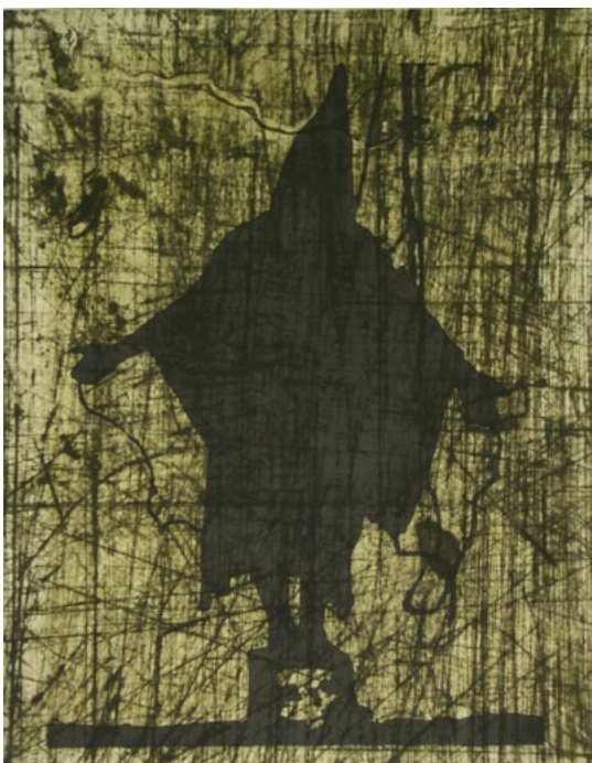
Abu Ghraib , Rupert Garcia, 2004, mixed media chine collé, 18 x 14 in.

is unmistakably a prisoner at Abu Ghraib, yet the artist's obscured interpretation turns the image over to the viewer's associative mind. Conjuring images of the KKK, electric chair executions, and death, the figure represents the dark side of American history, the part of human nature one does not like to believe possible. Abu Ghraib , 2004, was created for the Corcoran Gallery's first print portfolio, which will be shown in 2005 at the Corcoran Gallery in Washington DC. Appropriately, the Corcoran Gallery is located only one block from the White House. ■