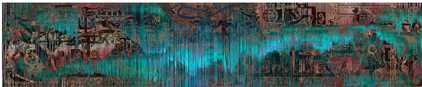
Above: 2 of a series of 8 by Hung Liu, Music of the Great Earth Variations , ed. 20, published by Magnolia Editions.