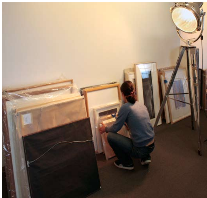
Preparing for the Print Sale in the front room at Magnolia Editions.

Magnolia invites collectors and print lovers to participate in its first ever sale of works returning from museum and gallery exhibitions. During the first week of June and during Open Studios (June 7 and 14, Saturdays only), visitors to Magnolia Editions will be able to browse through lithographs, etchings, collographs, monoprints and mixed media works from nearly 30 years of printmaking. Choose from hundreds of pieces, many of which are framed and ready to hang; selected works are discounted to 50%, and frames are heavily discounted as well. The sale is only for visitors; sale prices and details will not be available by web, email or phone. Sorry, we cannot ship framed sale pieces. ■