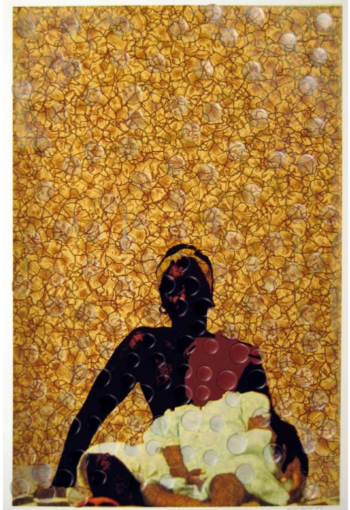
Mildred Howard, The Magnolia Project: IV , 2008; mixed media print w/ buttons; approx 32 in x 39.5 in framed.

where elements are applied by hand, to Magnolia, where new elements are incorporated using a large scale flatbed printer. In some cases these elements have been scanned from older works and it is difficult if not impossible to tell which parts are hand-painted and which are printed. Also in the works are a series of mixed-media Saunders etchings which combine traditional copper plate etching with collaged elements. ■