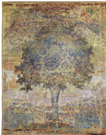
Donald & Era Farnsworth's 2008 tapestry Tree Thangka I , on view as part of The Eloquent Flower XII at Gail Severn Gallery.

Mon - Sun (7 days a week): 10 - 6 725 Canyon Road Santa Fe, NM 87501 (505) 986-9800 http://www.turnercarroll.com