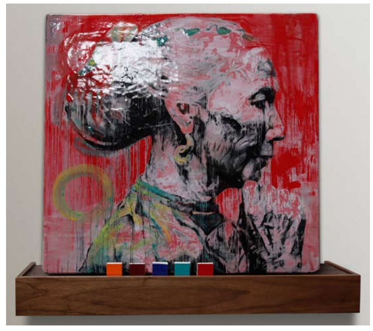
A new ceramic tile piece by Hung Liu on a custom display shelf. The five small squares in front of the tile are samples of the glaze colors used.

Inez Storer's first project at Magnolia Editions is an ambitious edition of mixed media images on panel: each edition includes 28 10 x 10 inch panels which use Storer's characteristic collage technique, combining whimsical figures, images from 19th-century engravings, maps, paintings, and drawings, to form a variegated and picaresque World Map . This work will also be exhibited at the Bedford Galler's Story Painters show (please see Shows & Events for full details) and in April, will be shown at Seattle's Grover Thurston Gallery.