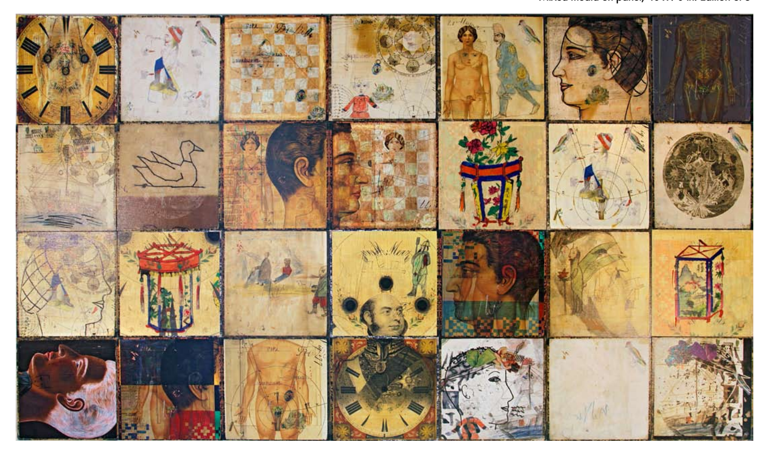
Inez Storer - World Map, 2010 Mixed media on panel; 40 \times 70 in. Edition of 5