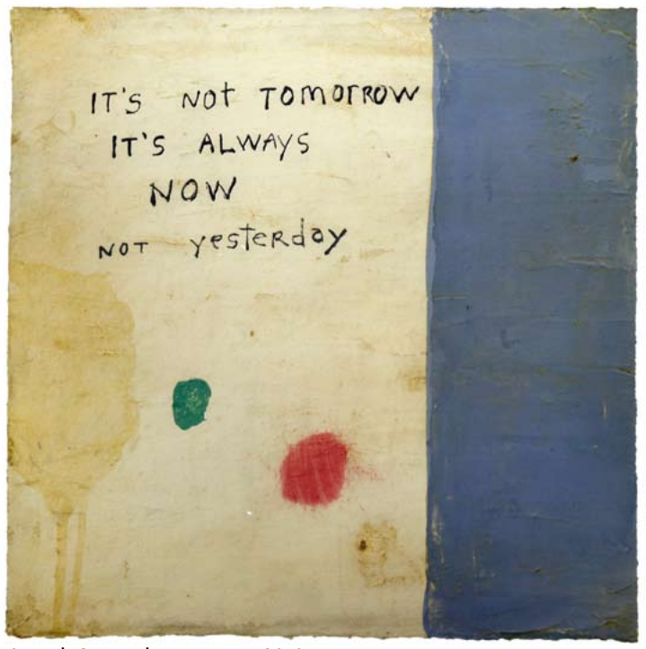
Squeak Carnwath - Tomorrow, 2010 Acrylic with marble dust on gessoed paper; 16 x 15.75 in. Edition of 12