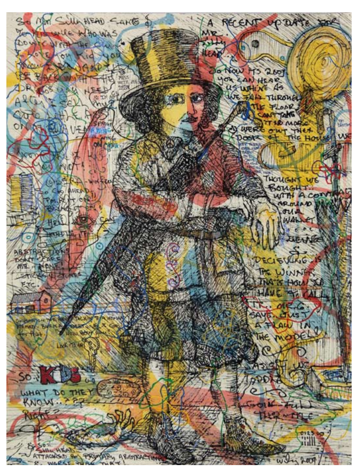
William Wiley - Mr. Sillyhead with Abstraction, 2009 Photogravure with acrylic and mixed media; 29.5 x 22 in.

Squeak Carnwath's latest edition at Magnolia Editions is an acrylic print with marble dust on gessoed paper entitled Tomorrow . This serene and thoughtful composition doubles as a preview of another upcoming Carnwath project, a 'philosophy book' combining a series of textured prints like this one in a leather bound book-like case. In the coming months, Magnolia will also publish a collaborative book project combining art by Carnwath and poetry by John Yau; check our blog for updates.