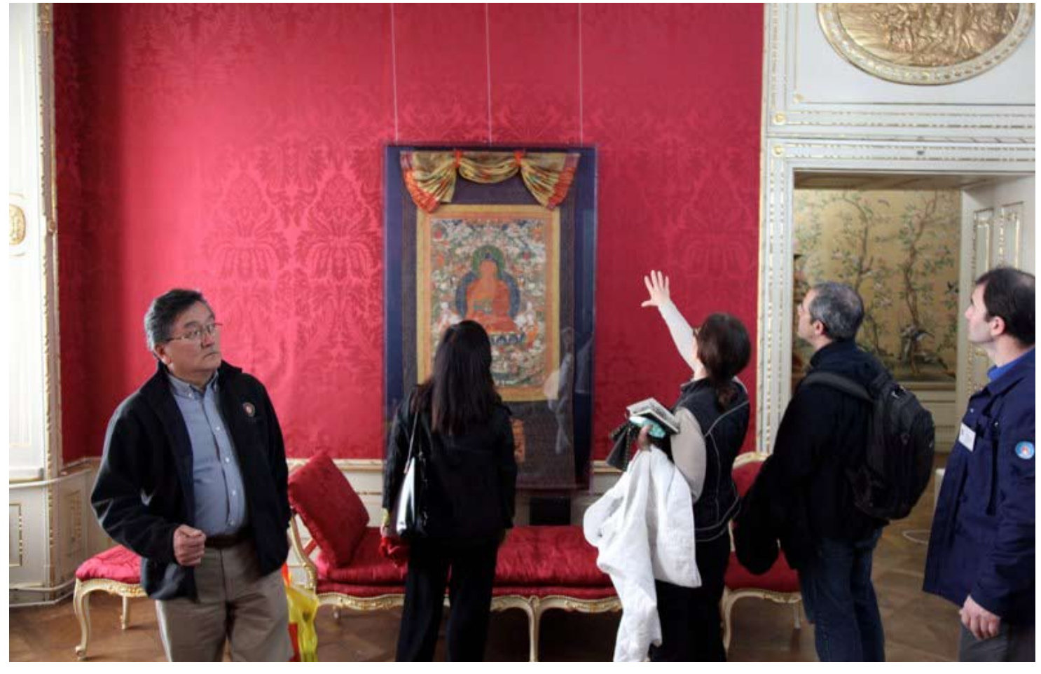
Visitors admire a thangka at The Missing Peace: Artists Consider the Dalai Lama at the Brukenthal Museum in Romania. The show will travel to the Nobel Museum in Stockholm in October of this year. More photos from this show can be seen at http://www.magnoliaeditions.com/Content/Brukenthal/Brukenthal.htm