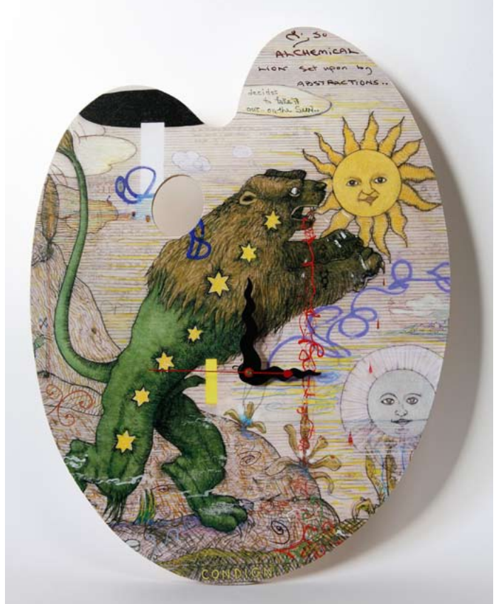
William Wiley - Untitled clocks UV-cured acrylic, hand painted acrylic and metallic ink, and Seiko mechanism on gessoed panel, 14.25 \times 10.75 \times 0.75 in.

petta portfolio with hand-distressed leather, lined with watermarked Iris book cloth, which is presented in a black leather satchel with a red leather interior.