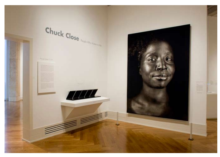
Lorna (2006) at the Virginia Museum of Fine Arts