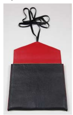
Squeak Carnwath - Philosophy, 2010 Artist's book: double-sided acrylic prints on paper textured with gesso and marble dust, Canapetta/leather portfolio, leather satchel portfolio - 12 x 10.5 x 1 in.; prints - 11 x 10 x 0.125 in. Edition of 20

edented detail, allowing the reader an intimate glimpse of Carnwath's brilliant inner universe. Each double-sided page was printed on paper textured with hand-brushed marble dust and gesso, registered so that the printed acrylic aligns with the textures with uncanny precision. Donald Farnsworth developed the process with printer Tallulah Terryll: "We've sculpted these pieces," he says, "to be true to Squeak's mark." In a letter to John Yau, Farnsworth wrote of the book: "We are moving into strange and dangerous territory – printmaking that may raise some eyebrows... making textures that were, before this, the private playground of painting and sculpture." The book is housed in a Cana-