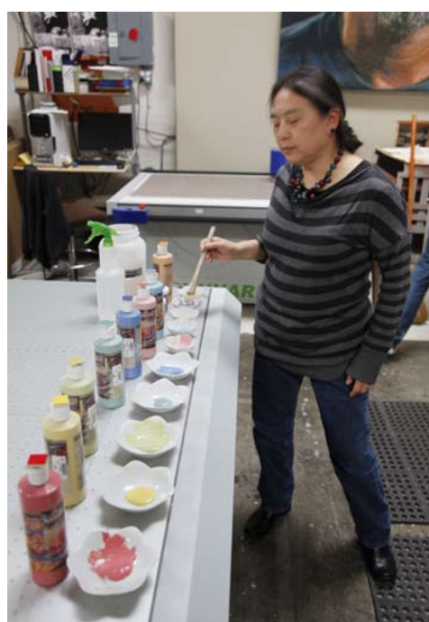
Left: Hung Liu - Old Red Woman, 2010 Painted glazes on handmade ceramic tile; 18 x 18 x 0.75 in.

Right: Hung Liu preparing to paint tiles at Magnolia Editions, February 2010.