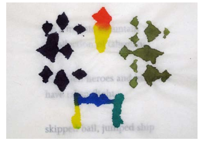
Detail of pages from A Child's Vi[r]gil. Prangenberg's watercolors are painted on translucent paper; Yau's poetry can be glimpsed underneath.