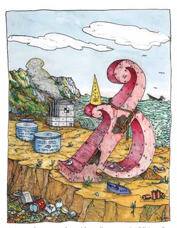
Ampersand,\,2011,\, woodcut with acrylic, 30 x 22 in. Edition of 30 Published by Oxbow School, Napa, CA

Working from a black-and-white drawing of the Mr. Unnatural character printed as a multiple at Magnolia, Wiley created a highly varied suite of watercolored Sissy Fuss images, adding different hand-painted color washes and pun-saturated commentaries to each one; he and Magnolia's Donald Farnsworth then worked together to combine their favorite pieces of each image digitally. The final edition is a composite,