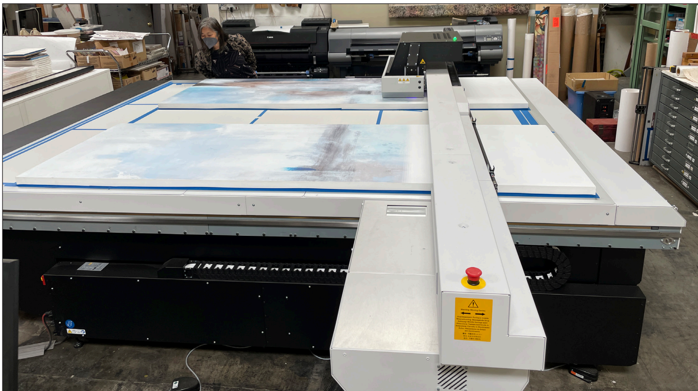
Flatbed acrylic UV Printer – 10'x 8' up to 1.75" thick