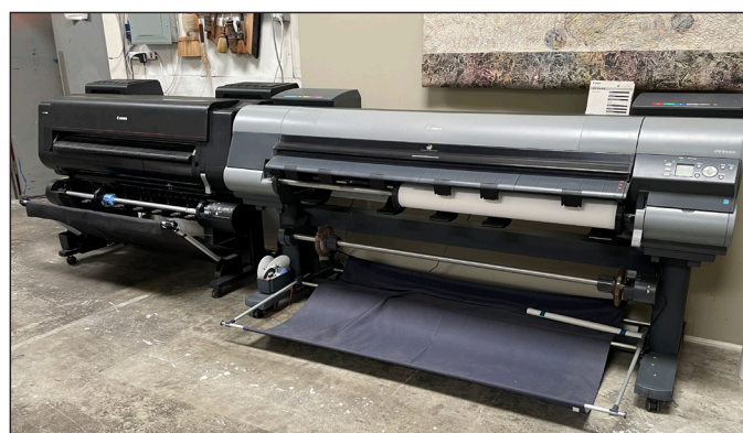
Canon IPF Pro 4000 & IPF 9400 - 12 color water-based inkjet printers at Magnolia Editions.

For artists wishing to work from transparencies, there are several options. A flat bed 4" x 5" scan can be made in-house for $35 per scan .